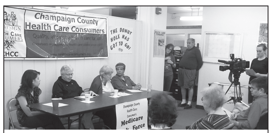
Members of the CCHCC Medicare Task Force speak at a press conference about health reform in May 2010.