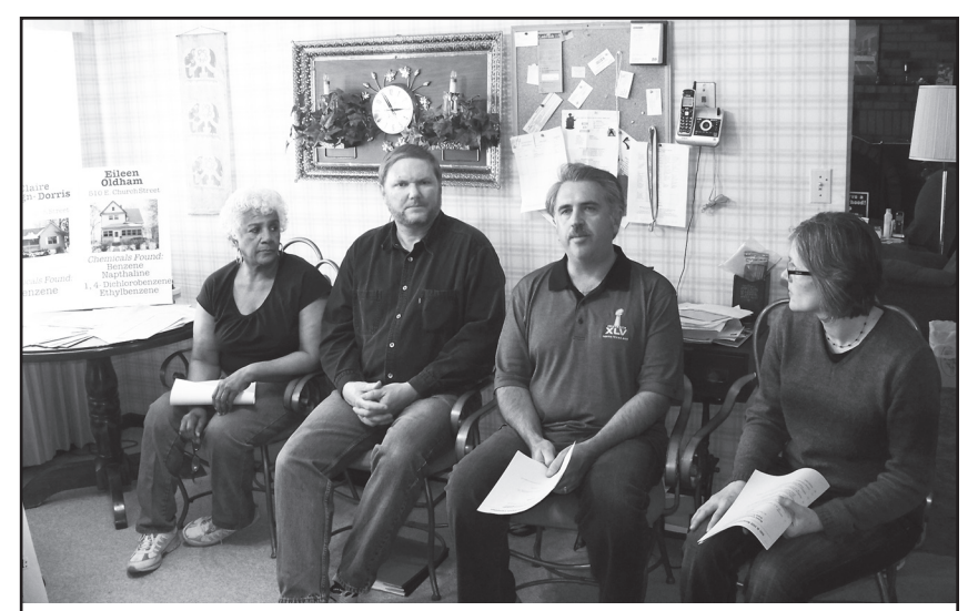
Members of the 5th & Hill Neighborhood Rights Campaign speak alongside environmental experts at a press conference in February 2011.