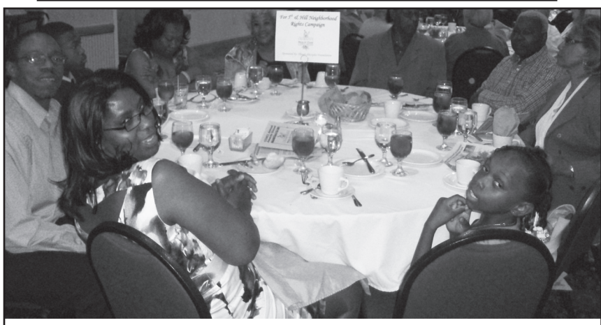
Members of the 5th & Hill Neighborhood Rights Campaign enjoy the Annual Awards Dinner in 2010.

Medical Clinic for the uninsured residents of Champaign County