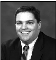
Rep. Chapin Rose (Republican)