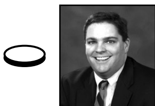
Rep. Chapin Rose (Republican)