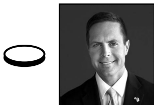
Rodney Davis (Republican)