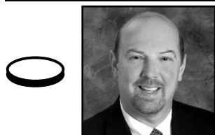
Rep. Chad Hays (Republican) (Incumbent)