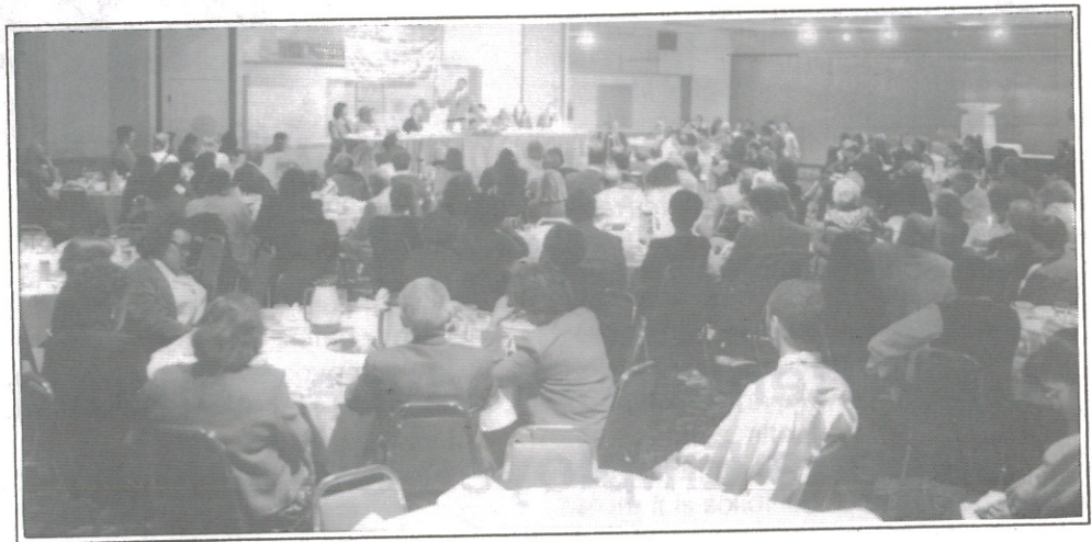
A packed room listens as U.S. Rep. John Conyers, Jr. explains his single-payer, universal health care legislation at the Health Care Consumers' Awards Dinner.