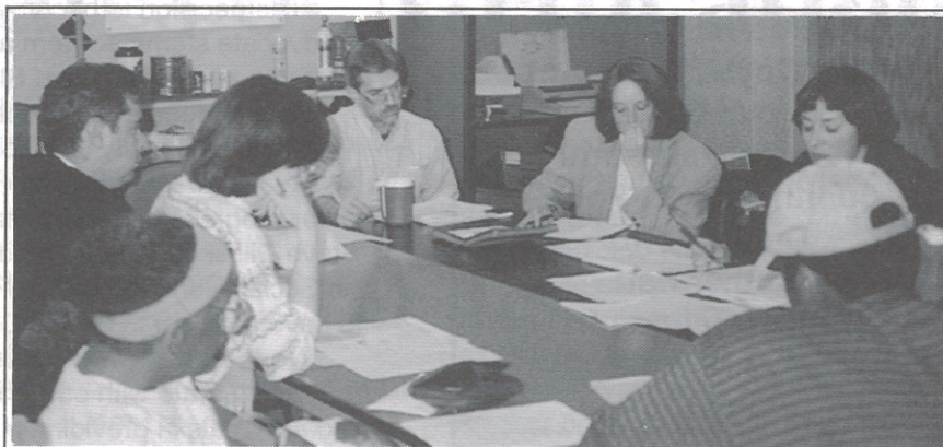
At Task Force meetings, consumers discover systemic problems in Carle's billing and collection practices.

Health Care Consumers held meetings with members of the community who have been affected by these problems, or who are concerned about the potential impact of finance