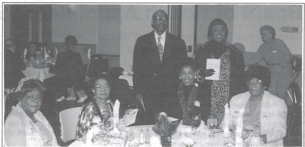
Members of the newly reformulated Senior Citizens' Task Force share a table at CCHCC's Annual Awards Dinner.