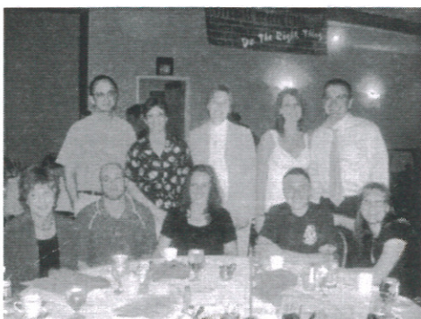
CCHCC members enjoying the 2007 Annual Dinner.

The Champaign County Health Care Consumers Annual Awards Dinner took place on April 20, 2007. This year's Dinner took on special significance as we celebrated the 30 th Anniversary of CCHCC! Founded in 1977 as a vehicle to empower consumers concerned about the health care system, CCHCC has grown from a handful of local residents into the largest, most effective grassroots consumer health advocacy organization in the nation.