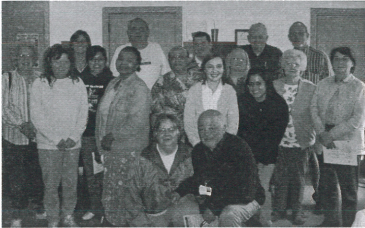
Medicare Task Force members at their monthly meeting.